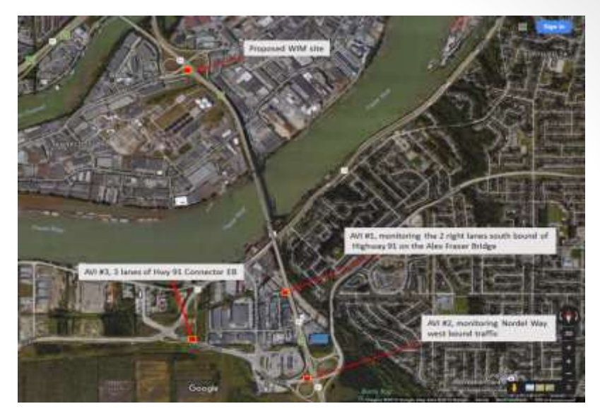
CVSE Nordel Inspection Station WIM & AVI