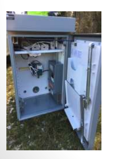
Equipment Install for ITS Testbeds, and Transportation Innovation and Data Labs