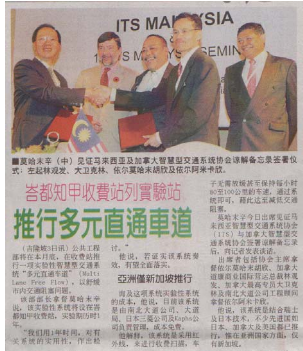
News clipping from Malaysian media